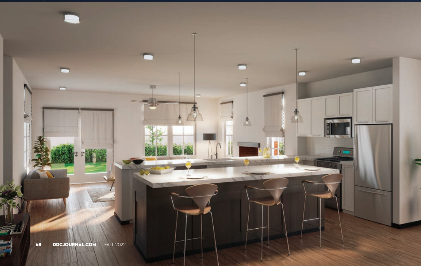
Single Family Home