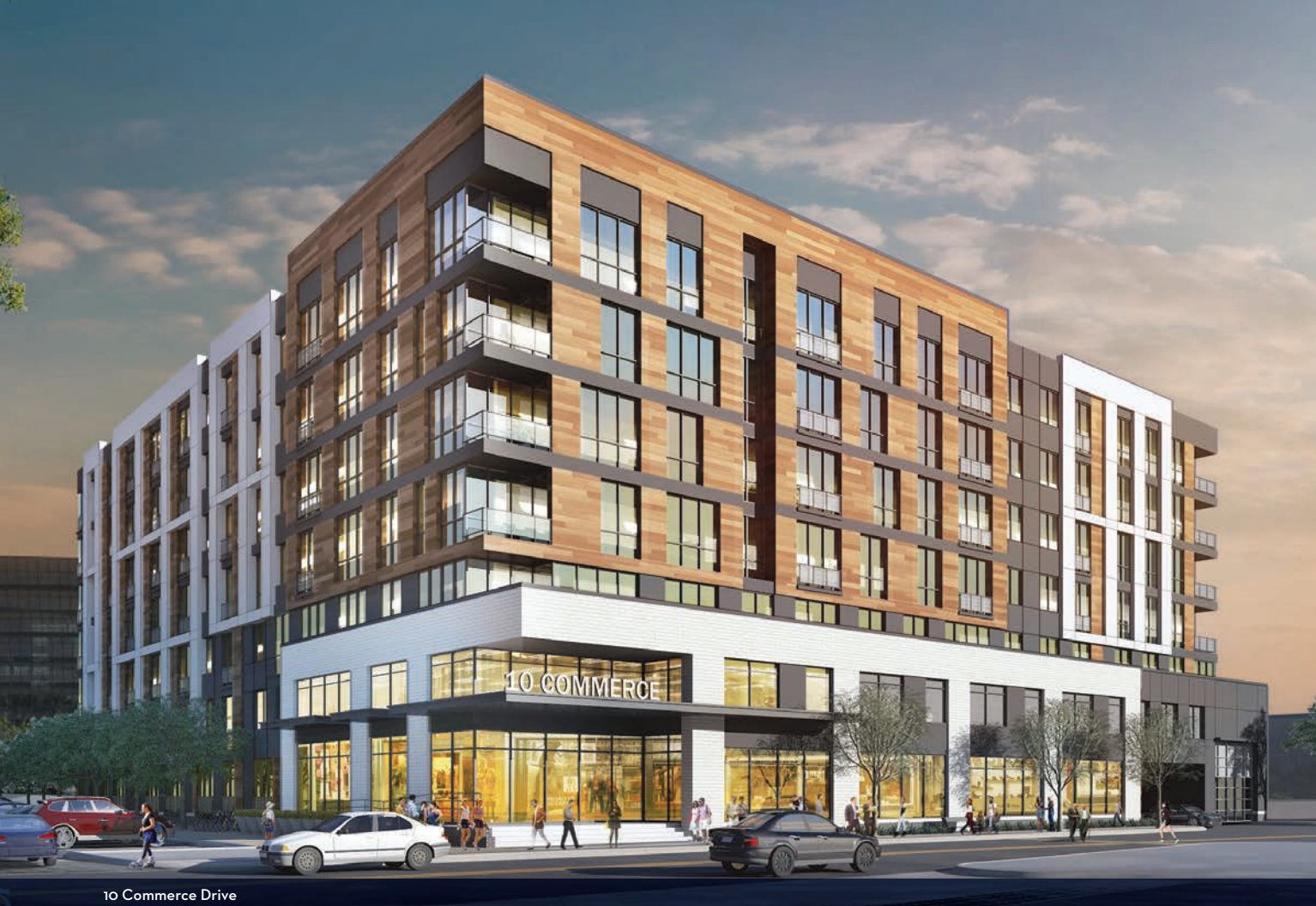
10 Commerce Drive